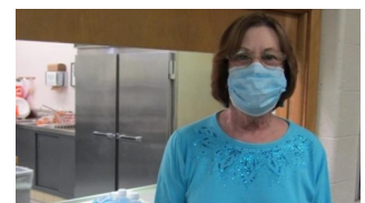
Meeting hostess and CLW VP of Communications greeted board members who attended the Fall Board Meeting at Emmanuel Lutheran Church in Dearborn, MI.