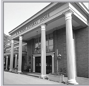
Grosse Pointe Woods 313.884.5500